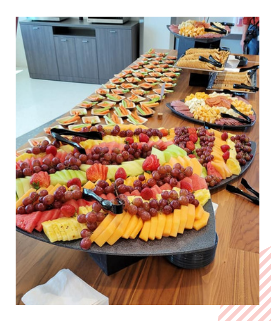
Work Options chefs and students prepared delicious displays and samples of menu items for the event.

Work Options Cafe, on the 3rd floor of the Adams County Human Services Center at 18600 N Pecos Street in Westminster, is the fourth training location for Work Options and will be open for breakfast and lunch Tuesday through Thursday from 7:30 am – 1:30 pm.